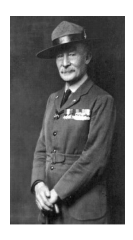
Founder of Scouting