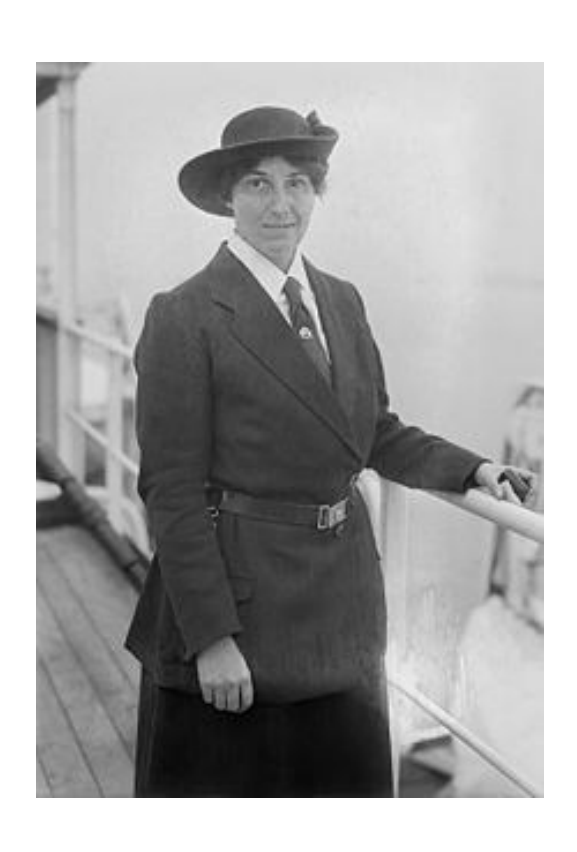
Founder of Guiding