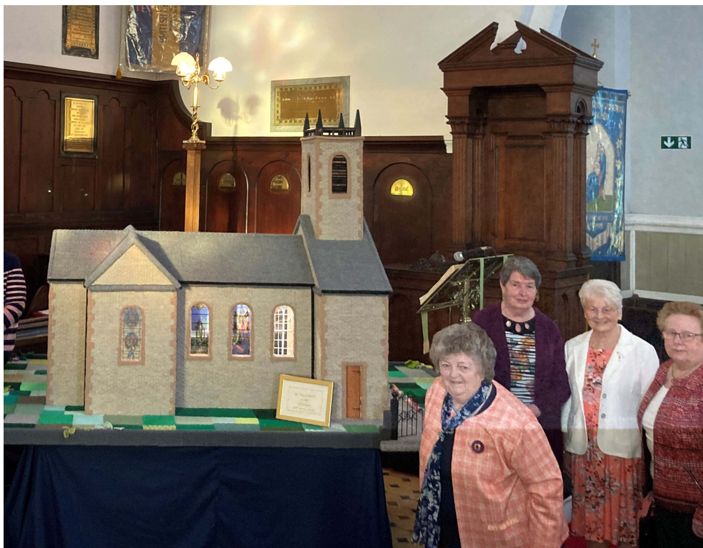
Members of the Knit Stitch and Natter Group with their model Cathedral.

A yearlong wait finally ended on Sunday evening, 26th June, for the congregation of the Clogher Cathedral Group of Parishes, when they unveiled their model cathedral constructed from a timber frame and knitted exterior. Members of the Knit, Stitch and Natter Group began their model Cathedral project during lockdown when they started knitting individual squares at home with the hope that when brighter days would allow, the squares would be brought together to form a single project. With the help of some carpenters, the creation of the miniature cathedral began and finished a year later.