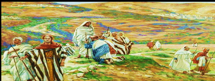
JESUS SENT THEM OUT TWO BY TWO BY JAMES TISSOT (1863-1902)