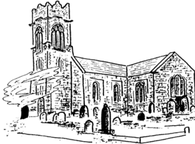
ROSSORRY PARISH CHURCH.