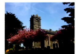
Annual Report and Statement of Accounts for the year 2020

Have been prepared and passed by the Select Vestry.